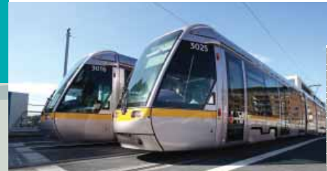
The Spencer Dock Luas Bridge