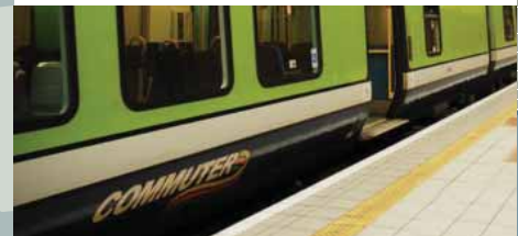
Rail Station at Spencer Dock

Spencer Dock has an unrivalled level of public transport immediately available. The Docklands train station is on the doorstep carrying 5,000 passengers per week. In addition the Spencer Dock LUAS stop opened in December 2009, the extended red line will carry 5,000 passengers per hour.