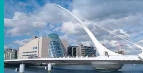
Samuel Beckett Bridge

Spencer Dock is perfectly placed in Dublin's evolving landscape. It is well served by road, bus, LUAS, DART, ferry, water taxi, rail and airport links.