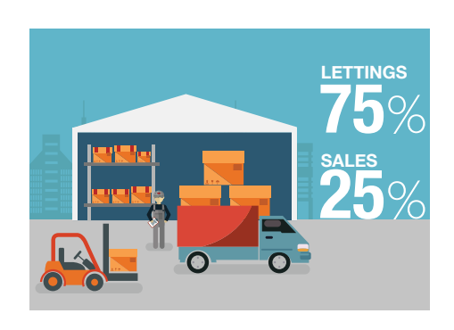
FIGURE 1 Take-up by type