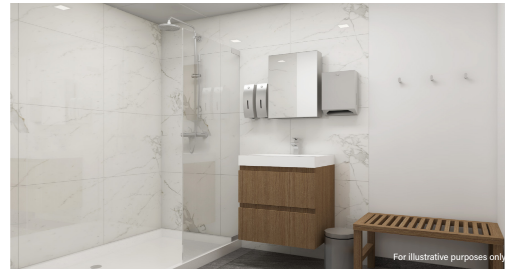
For illustrative purposes only.