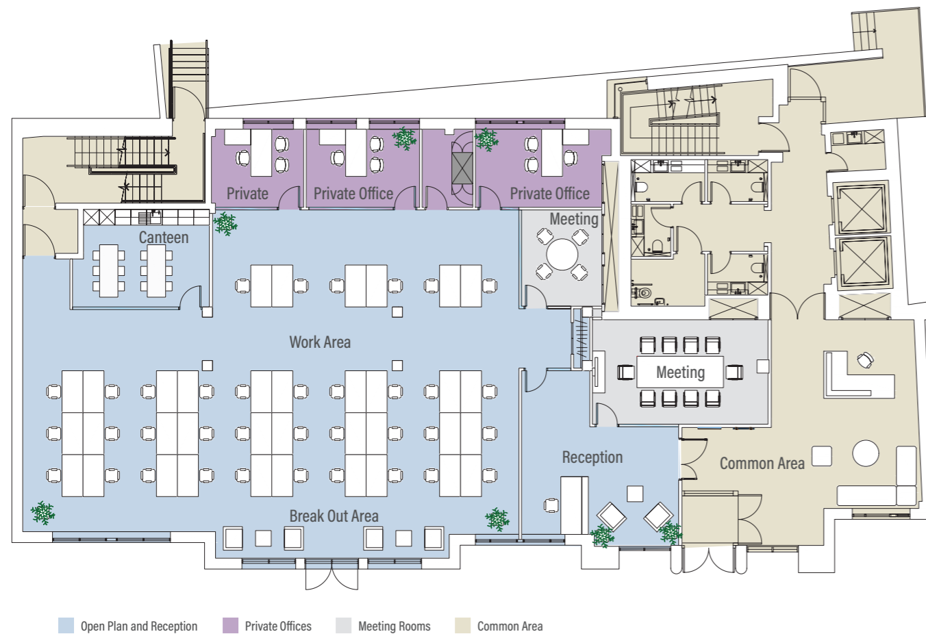
Not to scale. For illustrative purposes only.