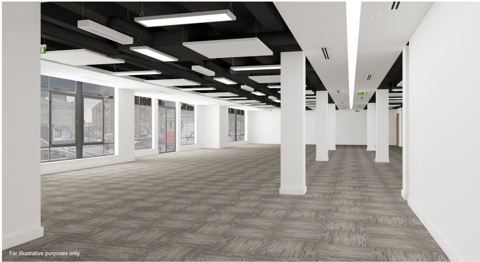
For illustrative purposes only.