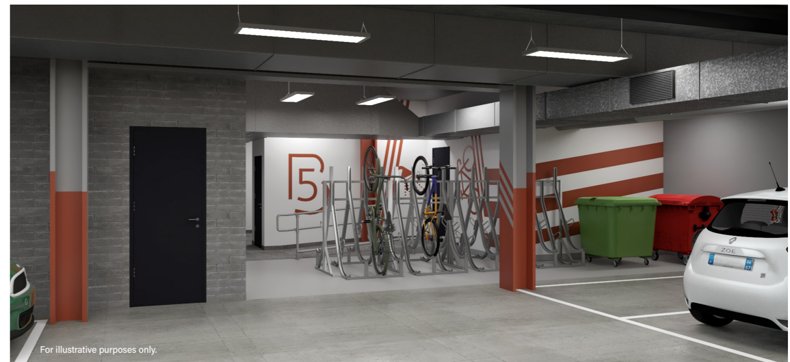
For illustrative purposes only.