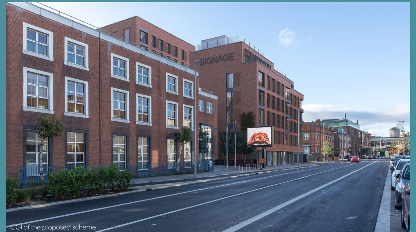
CGI of the proposed scheme